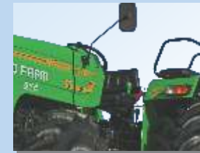
Constant Mesh Gear Box with Side shift gear levers for easy gear shifting & more leg space.