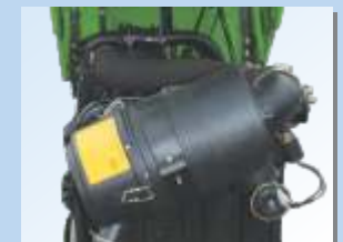
Dry Air Cleaner

Hydraulic (ADDC) : Two lever, automatic Draft and Position control with mix control.