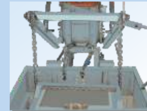
Heavy 2400 kgs Lift, suitable for heavy implements and tipping trailers with higher loads