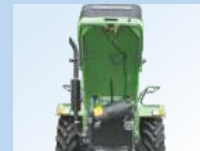
Aerodynamic Design- Easy approach for daily checkup like coolant level, air cleaner etc.