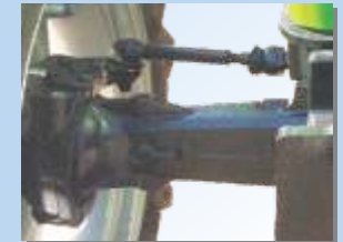
Heavy Duty Front Axle