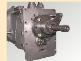
Epicyclic Reduction for High/Low Speeds-reduces noise & increases life.