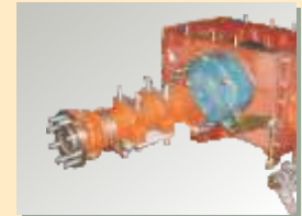
Brakes on Intermediate shafts resulting in no water ingress during puddling.