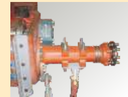
Straight Rear Axle for easy maintenance and minimum wear & tear.