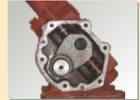
Recirculating Ball type Steering prevents transmission of shocks to the steering wheel.