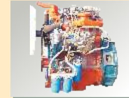
High displacement, Powerful Engine.