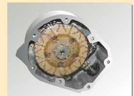
Oil immersed Brakes for better braking due to larger braking area & longer life due to oil cooling.

INDO FARM EQUIPMENT LIMITED AN ISO 9001 : 2015 CERTIFIED COMPANY