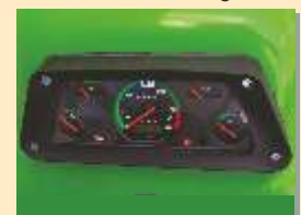
Low maximum rated Engine RPM - higher Engine life due to low wear and tear.