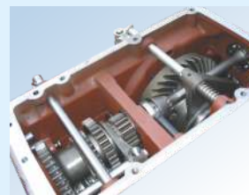
Synchronmesh Gear Box with 12+12 speeds Carraro Transmission