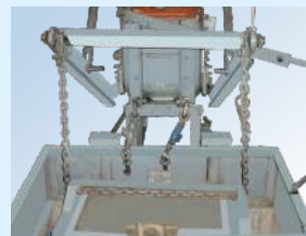
Heavy 2500 kgs Lift, suitable for heavy implements and tipping trailers with higher loads