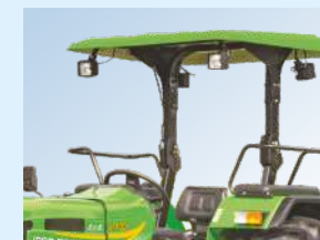
Foldable ROPS with Canopy