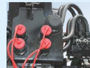
Multipurpose Selective DCV