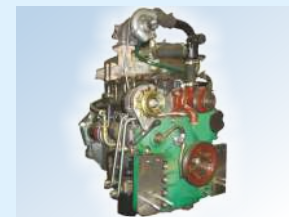
Powerful & Fuel Efficient Engine