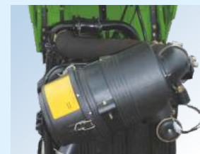
Dry Air Cleaner