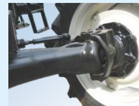
Heavy duty Front Axle & Power Steering