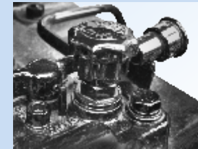
Use to lift the trolley without lifting of hydraulic lift.