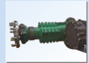
Straight Rear Axle, Less maintenance and repair