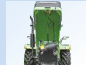
Aerodynamic Design- Easy approach for daily checkup like coolant level, air cleaner etc.