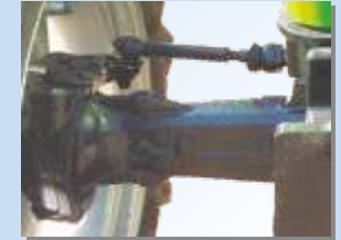
Heavy Duty Front Axle