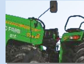
Constant Mesh Gear Box with Side shift gear levers for easy gear shifting & more leg space.