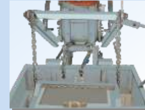
Heavy 2400 kgs Lift, suitable for heavy implements and tipping trailers with higher loads