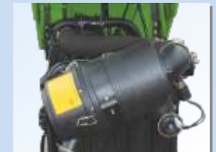
Dry Air Cleaner